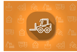
Construction, Manufacturing & Industry