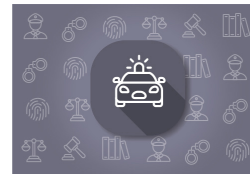
Public Safety & Law Studies