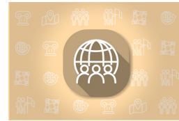
Humanities, Communication & Global Studies