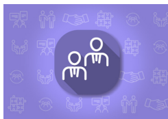
Social and Behavioral Sciences & Human Services